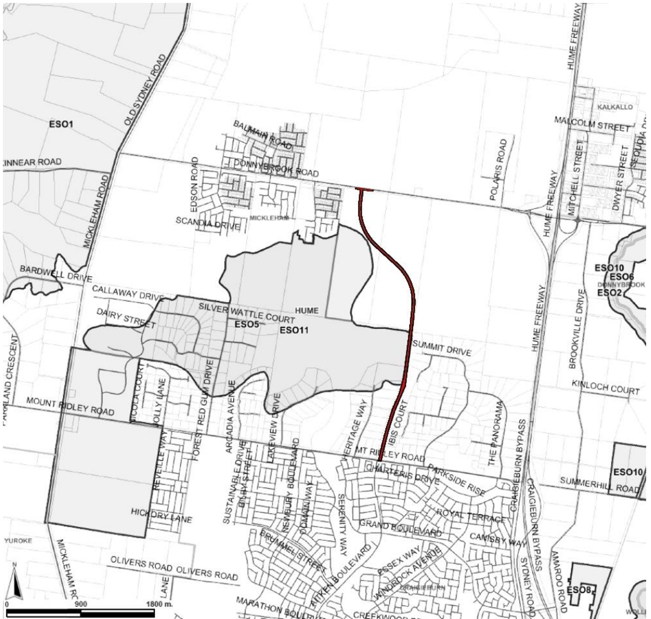
Figure 6.2 : Environmental Significance Overlay(ESO5 and ESO11) as it applies to the Project Area