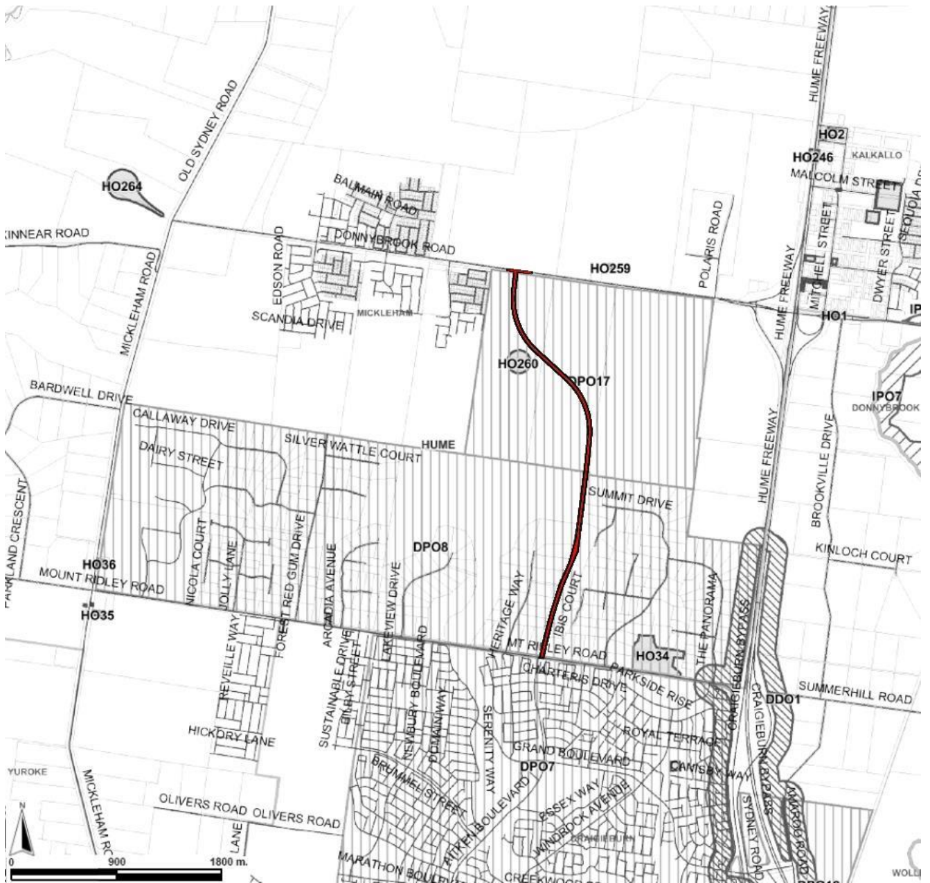
Figure 6.3 : Development Contribution Overlay as it applies to the Project area